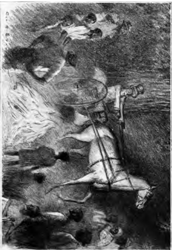
The old man was seated in a red-wheeled road cart, enveloped in a floppy linen duster, and wore a silk hat.